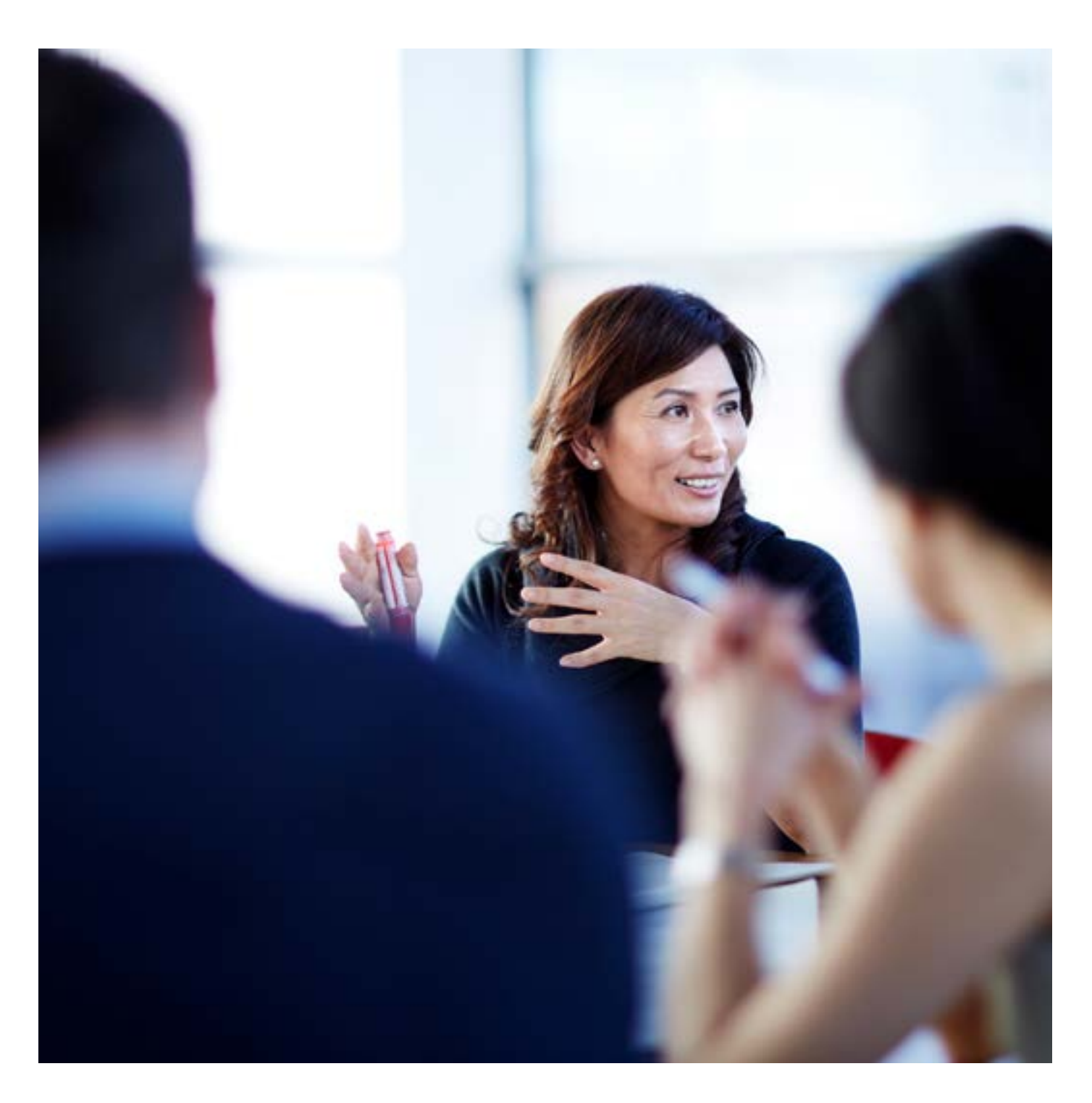
Crafting the Future of Influence

Unleash 'Her Power' in leadership to get through crises and beyond